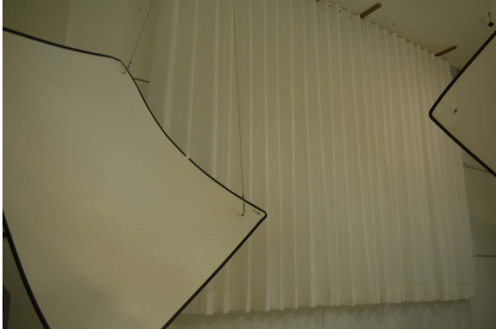
Figure B.3. Test object mounted in the reverberation room.