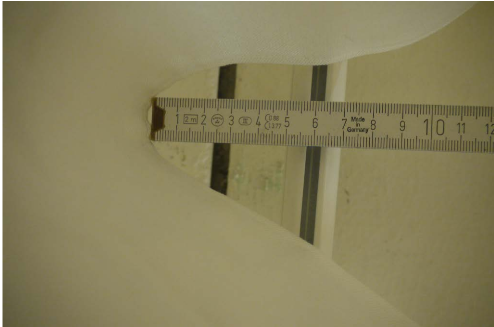
Figure B.1. System rail with crinkly mounted curtain.