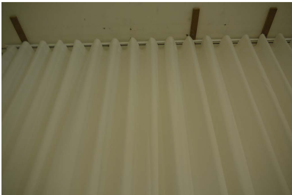
Figure B.2. Test object mounted in the reverberation room.